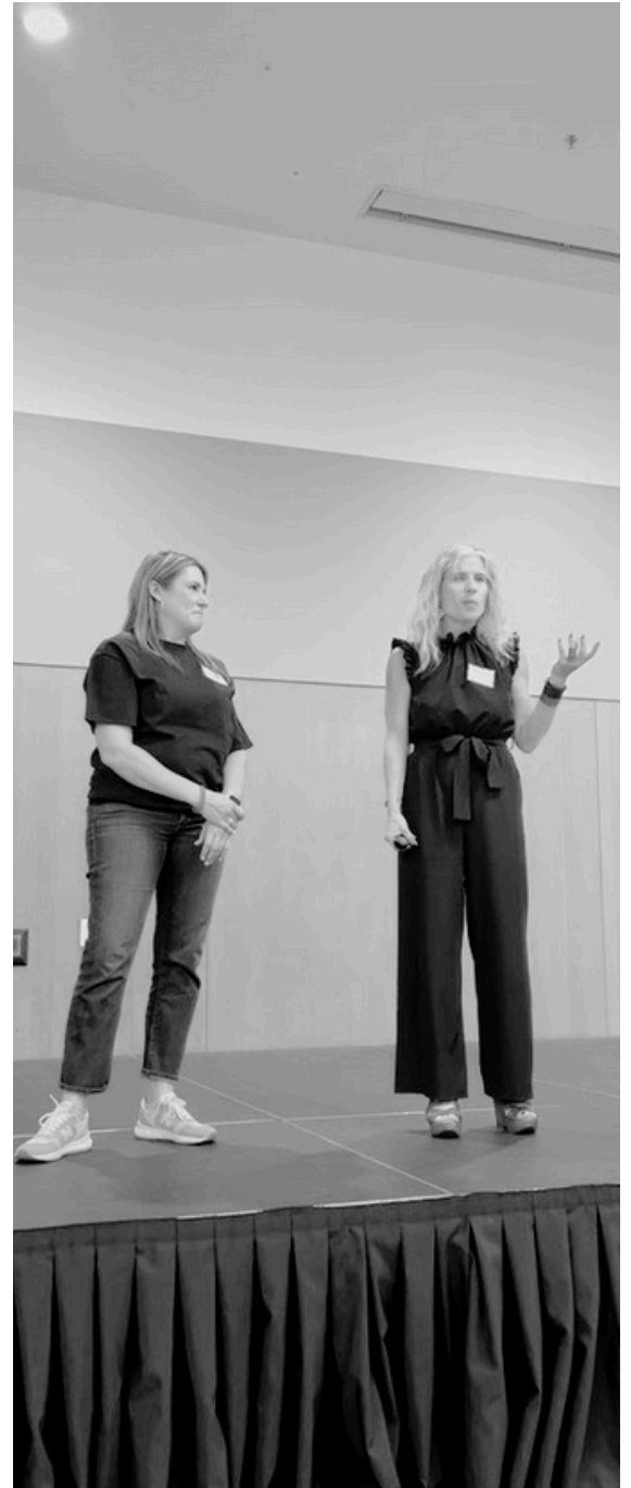
Let's Talk Suicide Conference: The Power of Connection

FailSafe For Life ESD 101 Inland Northwest Behavioral Health Mead School District Northpoint Recovery NAMI Spokane Inland Northwest Associated General Contractors Excelsior Wellness Kellan CARES Foundation Light A Lamp Nonprofit Spokane Outreach Networking Group Unite Us 988 Spokane Regional Health District Spectrum Center Spokane Multicare Health System, Inc. Martin Hall Juvenile Detention Facility Spokane County Medical Examiner's Office Frontier Behavioral Health Charmed Counseling PLLC Lutheran Community Services Journey Thru Grief Sharp Shooting Indoor Range & Gun Shop Survivors of a Loved One's Suicide Support Group (SOLOS) Spokane Veterans Affairs Healthy Ferry County Coalition Spokane Public Schools Specialized Training and Consultation Inc.