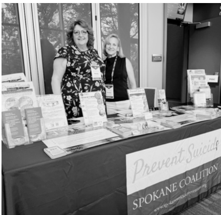
The coalition frequently tables and sponsors at community events.

PSSC and its members hosts and assists with multiple suicide prevention and postvention training events each year, including ASIST, QPR, CALM, Screenagers, Healing After a Suicide Loss, and many more.