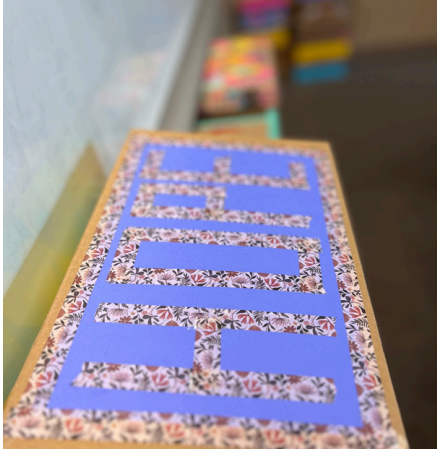
Hope Squad boxes assembled by students.