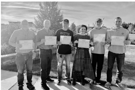
Construction professionals at ASIST Training.

PSSC meets monthly on the first Tuesday of every month in-person and virtually. Your level of involvement is completely up to you! Tier 1 members regularly attend monthly meetings and have voting authority, while Tier 2 members attend when they can. Membership is low-pressure and flexible. The only cost for membership is your time - no fees!